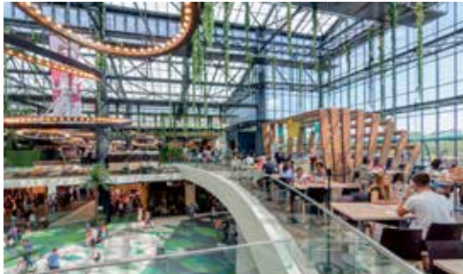
PARKLAKE · ROMANIA

Under the concept of “meeting nature” it links the interior design with the exterior, bringing the outside of one of the greatest parks in Bucharest inside the shopping centre.