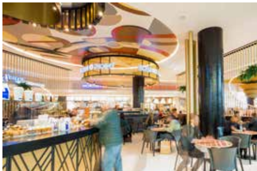
ALEXA · GERMANY

With a modern and fashionable look this food hall in Milan is tailored to fulfil its visitors’ needs: it has multiple kiosks, eco-stations, 6 lounge areas, silence pods, dining swings, a variety of different seating arrangements and even a stage to host multiple events.