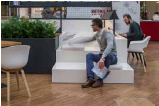
CITYLIFE SHOPPING DISTRICT · ITALY

Under the concept of “meeting nature” it links the interior design with the exterior, bringing the outside of one of the greatest parks in Bucharest inside the shopping centre.