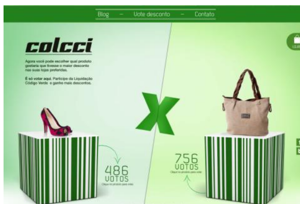
Figure 4: Battle of the Green Code promotional material

We organised a 'Battle of the Green Codes' to raise awareness among shopping centre visitors in the build up to the campaign. Discounts of up to 70% were offered on thousands of selected products in a variety of stores. Shops asked customers to vote for which of two products they wanted a greater discount on. The product with the greatest number votes received the biggest discount. Customers could also sign up to receive an e-mail with a list of the winning products once they were announced.