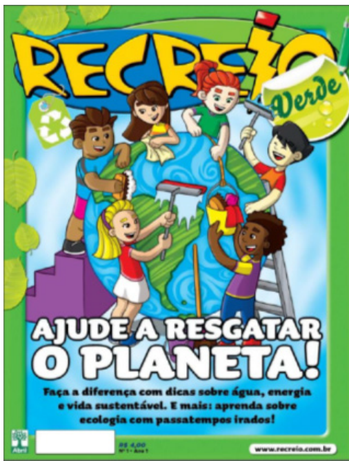
Figure 1: The "Recreio Verde" magazine published in June 2012

"Recreio Verde" contained information on Sonae Sierra Brazil's sustainability journey, including the company's environmental and social responsibility initiatives presented in an easy to understand and engaging way. Through simple language and illustrations, children could learn more about our approach and the progress we have made to date.