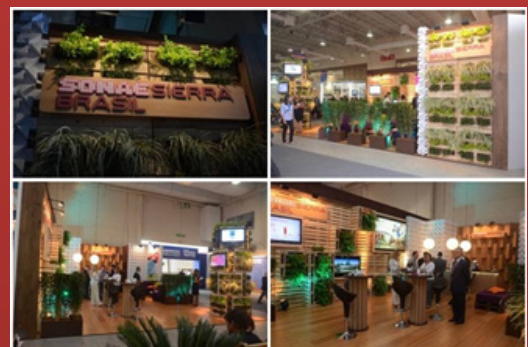
Figure 5: Sonae Sierra's environmentally-friendly stand at the ABRASCE Exposhopping Event

The stand we used for the event was made out of sustainable and recycled materials such as paper, cardboard and wooden pallets. All the materials used for the stand were then donated Casa de Zezinho (a cultural and educational charity that works with children from underprivileged backgrounds) and Cooperacaacs (a cooperative that works with recycled materials to create alternative art).