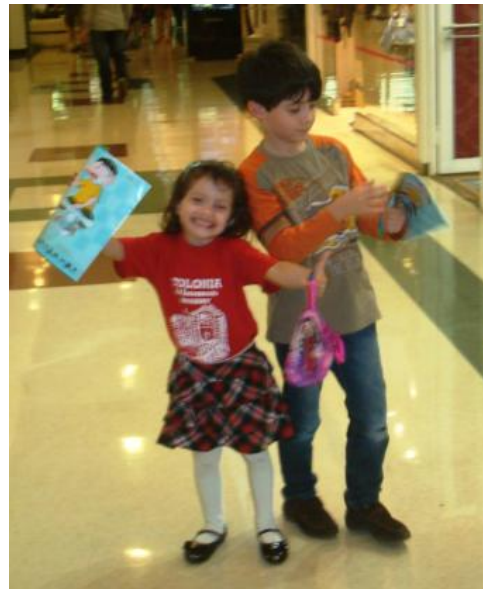
Figure 2: More than 20,000 copies of "Recreio" magazine were distributed to children visiting our shopping centres.

Laureane Cavalcanti Corporate Marketing Manager for Sonae Sierra Brasil