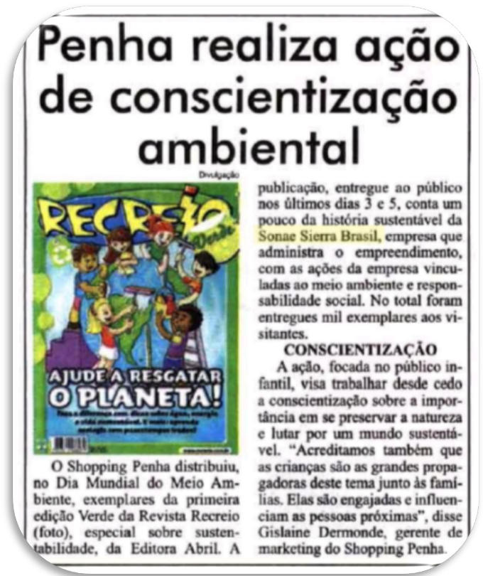
Figure 7: Example of article about the green edition of "Recreio" magazine

Designing an entertaining and engaging green edition of Recreio magazine meant that we could get our message to children in an effective way and create a lasting impact. More than 20,000 copies of the magazine were handed out to children in Sonae Sierra Brasil shopping centres in the states of Sao Paulo, Amazonas and Minas Gerais. Copies were also given to employees' children so that they could also enjoy the magazine and share the environmental messages with their families. It also received significant press coverage, with more than 100 articles published in local and national newspapers.