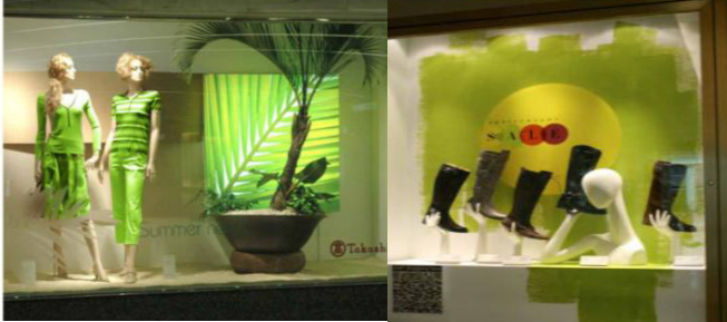
Figure 3: Green window display

We also created an online "Green Attitude Quiz", which was accessible through our shopping centre websites. Visitors answered a series of sustainability-related questions about their actions and behaviour to create a personal environmental profile and measure how "green" they are. Participants could share their scores with friends and families via social media.