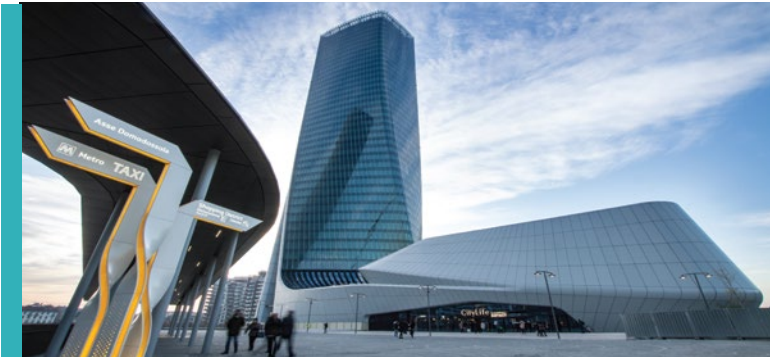
CITYLIFE SHOPPING DISTRICT, ITALY

MODERN PROJECTS THAT CREATE NEW PULSING HUBS IN THE HEART OF CITIES