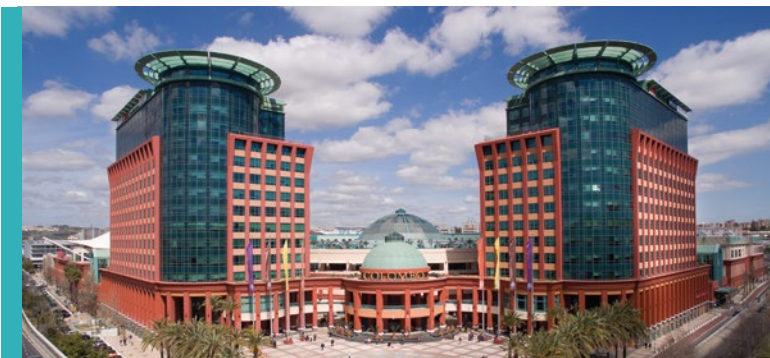
CENTRO COLOMBO, TORRE OCIDENTE AND TORRE ORIENTE, PORTUGAL

Centro Colombo is one of the largest shopping centres in Europe surrounded by two of the most famous office towers in the city. The mixed-use project with more than 110,000 m 2 of retail GLA and 50,000 m 2 of office area receives more than 25 million visits every year and is a key reference in Lisbon's urban landscape.